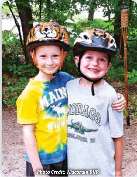
Buddies hanging out at Clear Lake.

A vehicle admission sticker is required on all motor vehicles within the campgrounds at Northern Highland-American Legion State Forest.