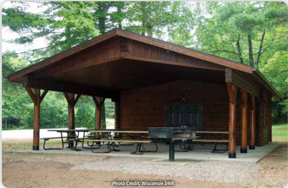
Reservable picnic shelter at Clear Lake day-use picnic area.