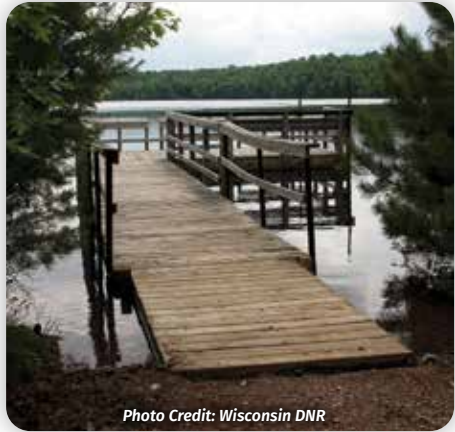
Fishing pier at Clear Lake day-use picnic area.