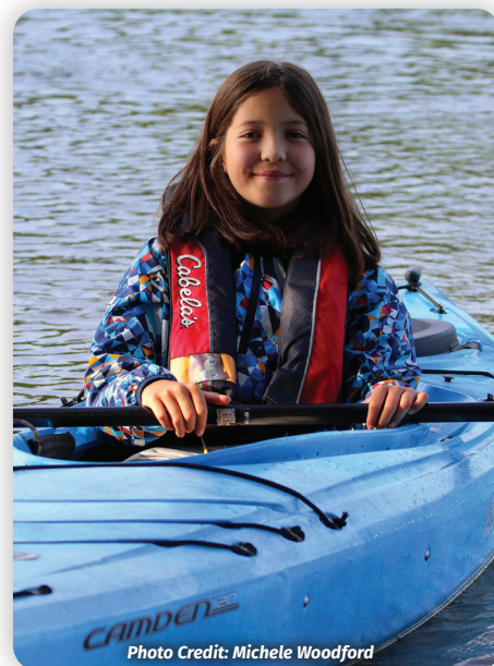
A great day for kayaking.

To make online camping reservations, visit CAMIS at: wisconsin.goingtocamp.com or call 1-888-947-2757.