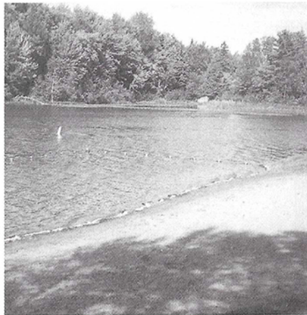
Lakewood-Laona Ranger District