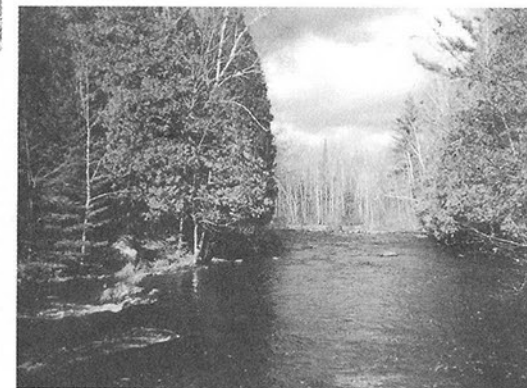
Lakewood-Laona Ranger District