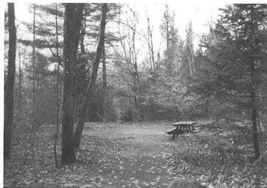
Lakewood-Laona Ranger District