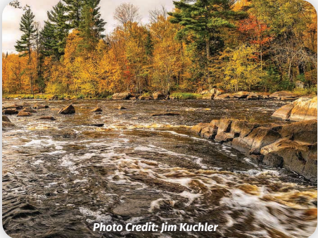
South Fork Falls

For additional information, contact the forest headquarters located at: W1613 County W, Winter, WI 54896 715-332-5271