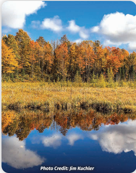
Tower Hill Road