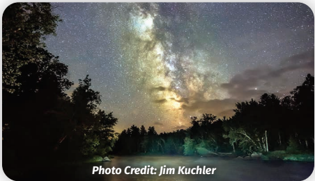
Starry night at Slough Gundy.